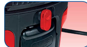
Battery safety catch

The tremendous advantage of a cordless RucSac cleaner will be more than obvious, NO CABLE, allowing it to be used in numerous difficult situations with exceptional results, climbing ladders, stairways, congested areas, busy pedestrian zones, cleaning aircraft, busses, even cinemas.