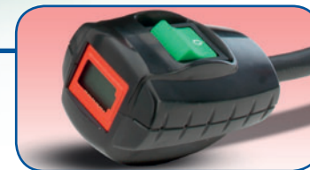
On/Off and charge indicator