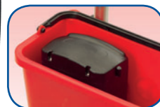
Battery carry caddy